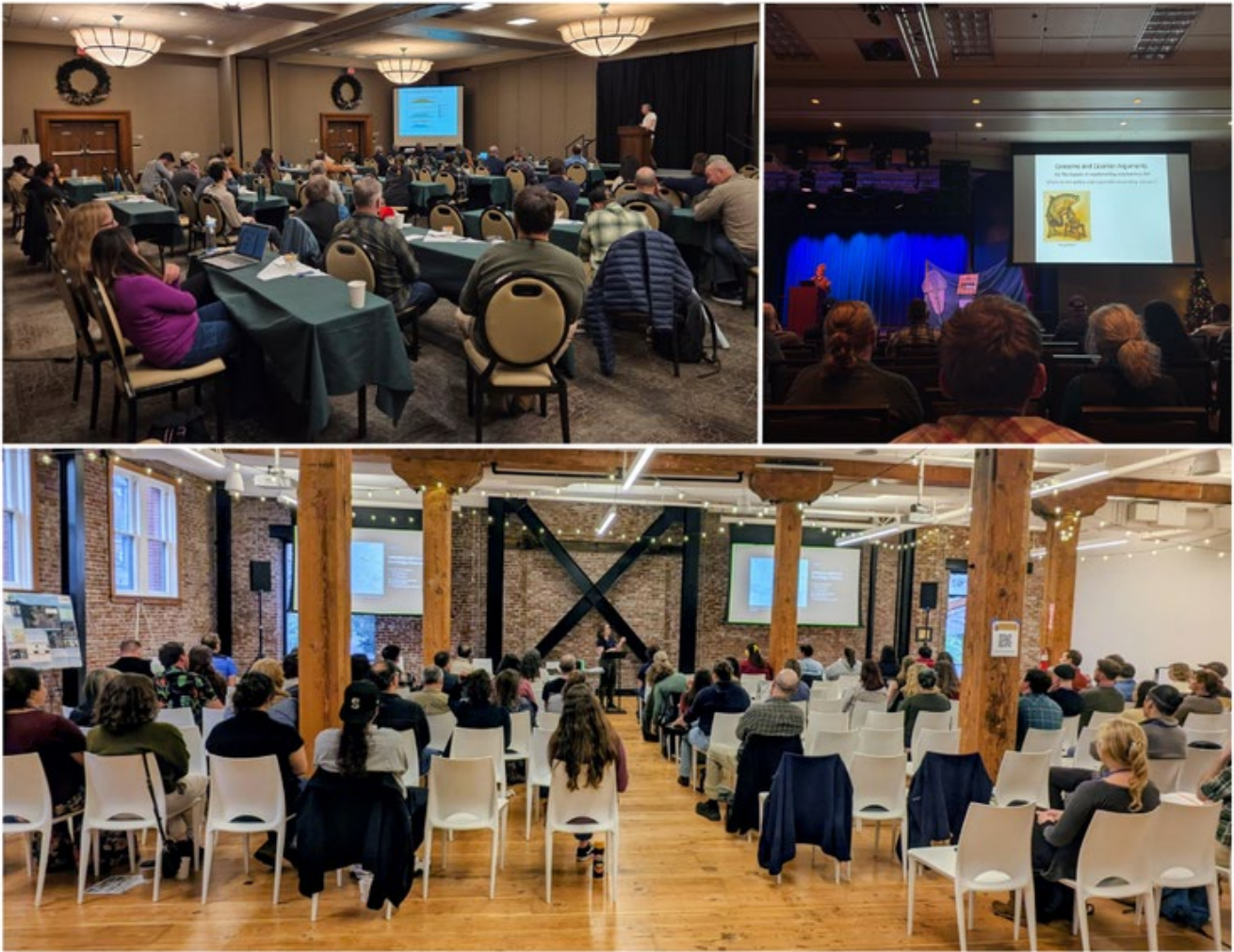
Top left: 2025 Pacific Coast Steelhead Management Meeting Top right: Northwest Fish Culture Concepts 74th Annual Meeting; Bottom: 9th Annual Lamprey Information Exchange

Pacific States Marine Fisheries Commission/PNAMP staff attended 3 different conferences on December 9th-11th: the 2025 Pacific Coast Steelhead Management Meeting, Northwest Fish Culture Concepts 74th Annual Meeting, and the 9th Annual Lamprey Information Exchange.