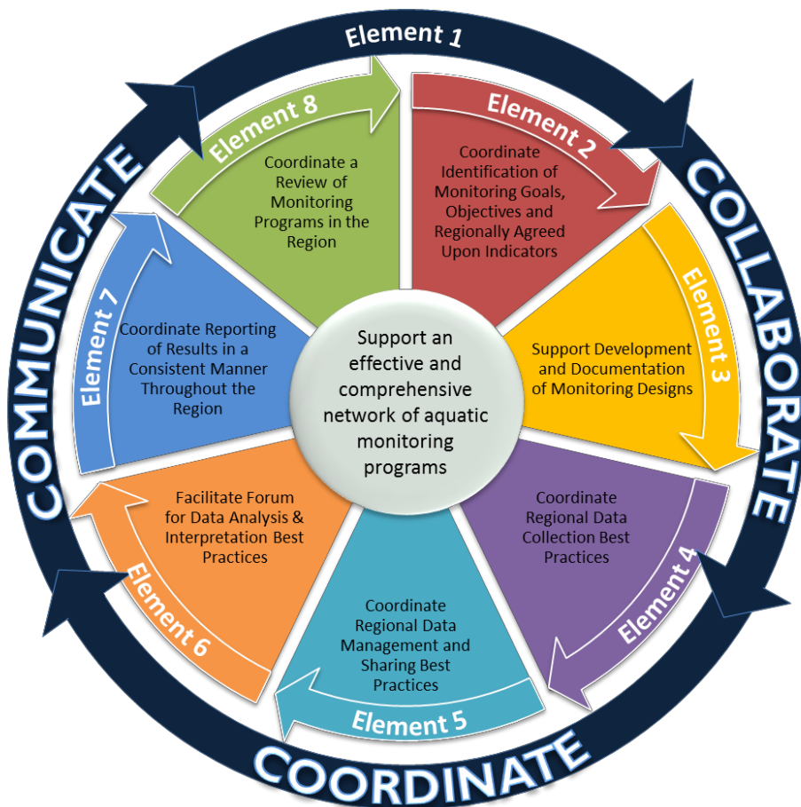
Figure 3. The conceptual framework for PNAMP’s 5-year strategic plan, based on the adaptive management monitoring wheel. The framework identifies eight elements that represent focal areas for PNAMP and is intended as a way to organize the objectives and clarify the relationships to the diverse array of monitoring activities that are happening throughout the region.

PNAMP’s specific actions that will be undertaken to accomplish the objectives will be tracked in annual work plans as projects and tasks. Through the Steering Committee, PNAMP intentionally connects this Strategy to partners’ management and policy decision making processes to ensure the partnership is adapting and responding to needs as they arise.